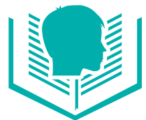
Group Education Model

The broader literature surrounding approaches to Recovery Colleges explores in greater depth the physical space and mode of delivery as well as the systemic consideration of integrating Recovery College and educational approaches within systems of care. ImROC is a national leader in the United Kingdom and holds a wealth of further reading. ( https://imroc.org/recovery-college-action-learningset/ )