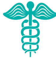
One-on-one Medical Model

Each of these items combined, including the scope of frustration in accessing mental health services, the evidence surrounding new paradigms of recovery support, and shifting roles of those with lived experience, all necessitated CMHA Calgary taking the bold action of building Recovery College on foundations of lived experience and education focused recovery.